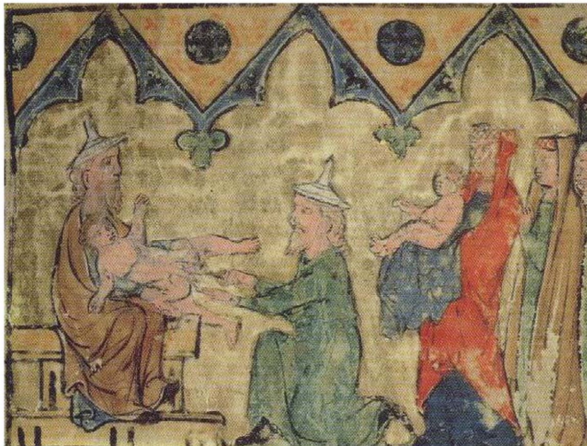
"Isaac's Circumcision," as depicted in the Regensburg Pentateuch, Germany, c. 1300.

Circumcision is seen as the central mitzvah (or commandment) of Judaism. Even for nonreligious Jews, circumcision continues to be perceived as the sine qua non of Jewish identity. And yet, unlike any other controversial topic that we Jews address, the subject of circumcision is not to be challenged. We can calmly discuss whether there is a G-d or no G-d, if G-d is masculine, feminine, or neuter, or whether homosexuals should become rabbis. Yet, questioning circumcision has been out of bounds. This taboo, in and of itself, is indicative of how strong the feelings are that surround this ancient rite, and how much lies below the surface, in the dark silence, where powerful forces have coalesced for thousands of years.