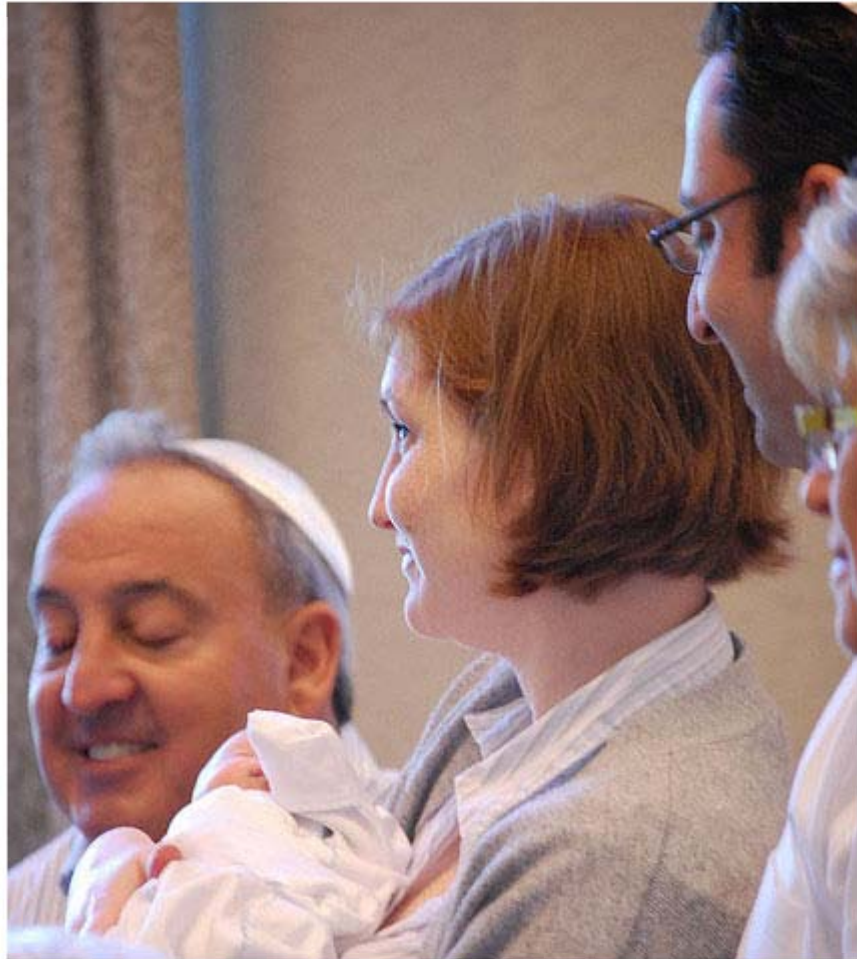
Many Jewish families continue to view their observation of the Torah's circumcision command as a joyous occasion.

Many of us Jews are capable of witnessing a bris , that is, a ritual circumcision, looking into the eyes of the shocked, terrified, and shrieking baby, his head flailing and chin quivering, as his foreskin is severed from the delicate surface of the glans, cut, and crushed, and many of us conclude that this is no different from a routine infant protest of having a wet diaper changed.